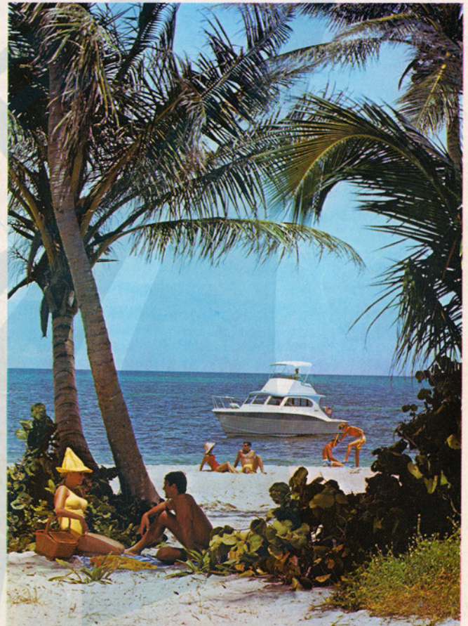
Florida Department of Commerce